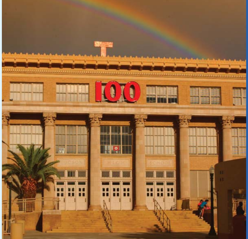
Tucson High's conveniently located near UA and downtown.