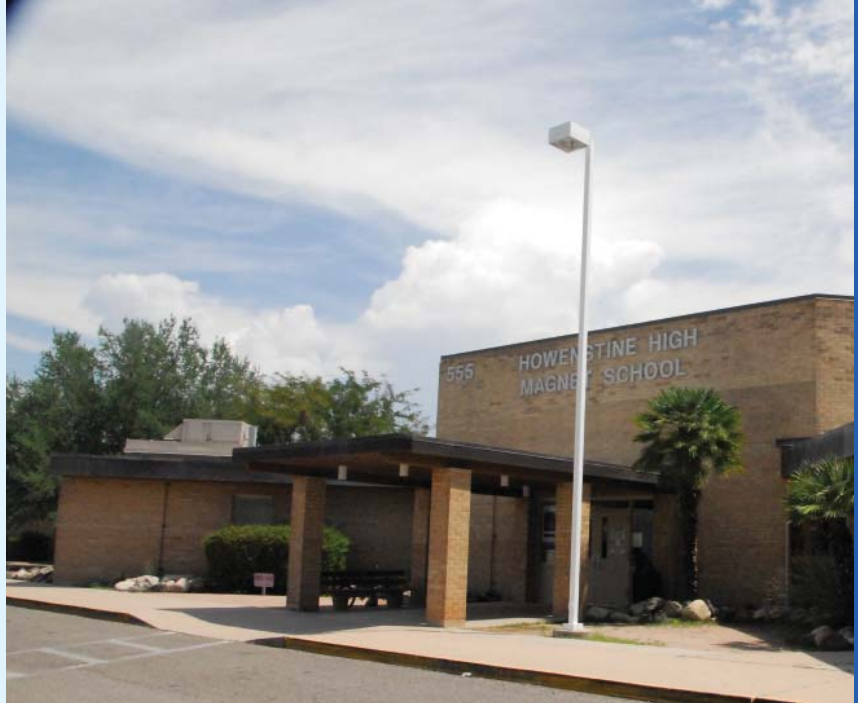
Howenstine offers a small school environment rich in diversity.