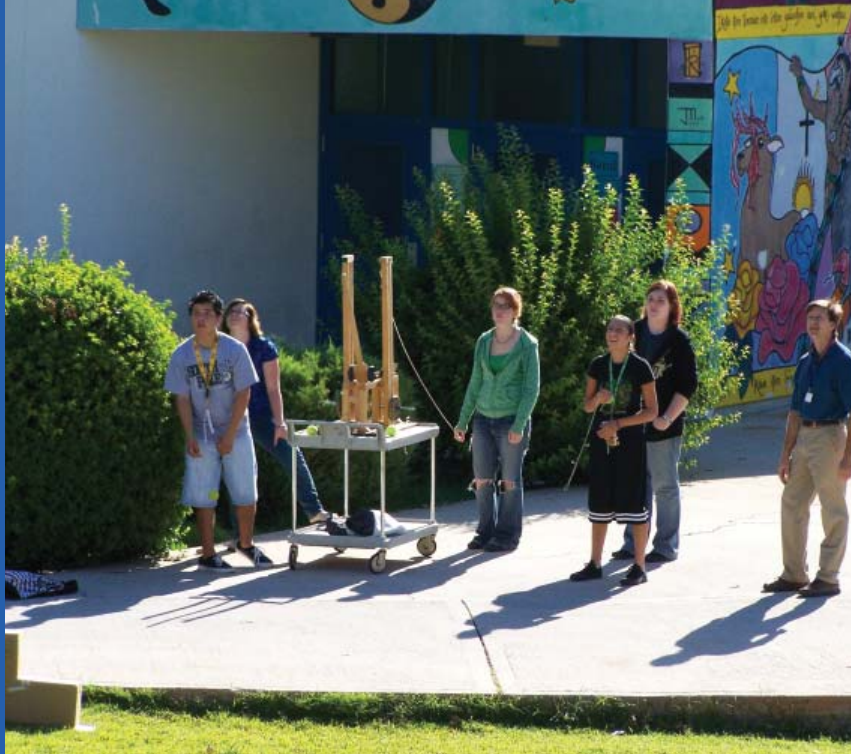
Physics classes provide the opportunity to test inventions.

Before entering the IB Program, I thought it was going to be the same thing as usual: my classes, just a little harder than the year before. I realized I was wrong during the first two weeks. I am not going to lie, the IB program is tough. I enjoy being in IB, because it is challenging and helps me learn as a global citizen. To do the IB homework I had to think outside of the box. The IB classes are full of students who want to learn, and it makes me feel safer, more open, and wanting to express what I think.