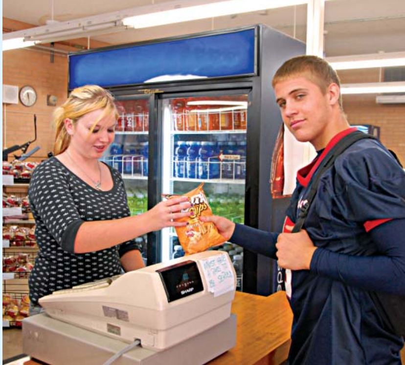
Sahuaro is proud of its winning traditions in sports and the arts.