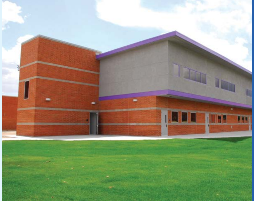
Small learning communities provide extra support for students.