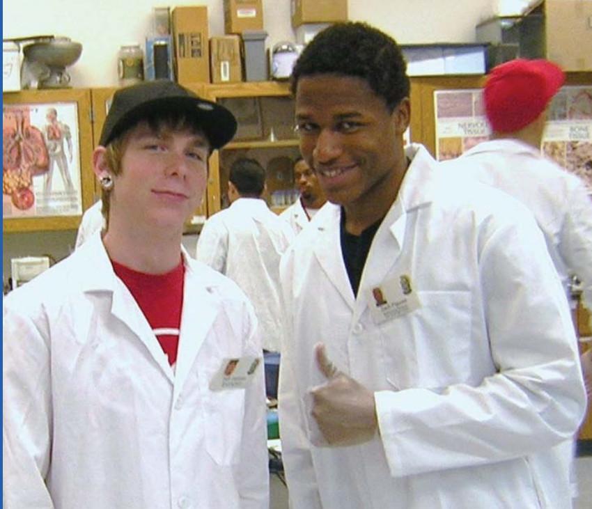
Palo Verde High's biotechnology program offers hands-on experience.

At Palo Verde you get more opportunities to do different things. It is more of a community, in that students from all different backgrounds help each other and share whatever they learn. It's much more open at Palo Verde between the students and the teachers, and you are not being pushed back by anyone or anything. I feel like I'm able to learn more and in better ways, and I have more chances to learn tools and important information for college in order to accomplish what I want to accomplish in my life.